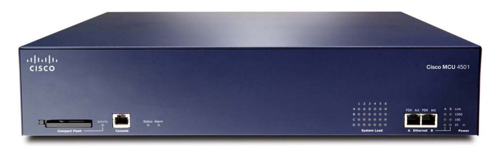
Figure 1. Cisco TelePresence MCU 4501