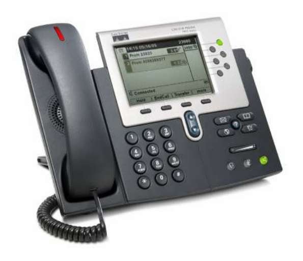
Figure 1. Cisco Unified IP Phone 7961G

The Cisco Unified IP Phone 7961G, an important addition to the Cisco Systems<sup>®</sup> award-winning IP phone portfolio, is a full-featured, enhanced manager IP phone. It is designed to meet the needs of managers and administrative assistants (Figure 1). It provides six programmable backlit line/feature buttons and four interactive soft keys that guide a user through call features and functions, and audio controls for high-quality duplex speakerphone, handset, and headset. A built-in headset port and an integrated Ethernet switch are standard with the Cisco Unified IP Phone 7961G. The phone also features a best-of-class large, higher-resolution grayscale pixel-based LCD (Figure 2). The display provides features such as date and time, calling party name, calling party number, and digits dialed. The crisp graphic capability of the display allows for the inclusion of higher value, more visibly rich Extensible Markup Language (XML) applications and double-byte languages.