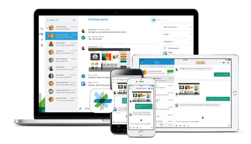
Figure 4. Cisco Spark Messaging

Cisco Spark Messaging is the generic term to describe the messaging capability of Cisco Spark, enabling one-to-one and team persistent messaging and content. Cisco Spark Messaging is the cloud-based persistent business messaging service within the Cisco Spark app. Messaging capabilities are accessible from any device and come standard with all paid levels of the service (Figure 4).