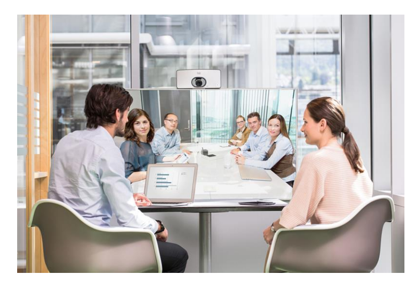
Figure 3. Cisco Telepresence<sup>®</sup> SX10 quick set registered to Cisco Spark

Cisco Spark supports a range of video devices for use within a Cisco Spark meeting.