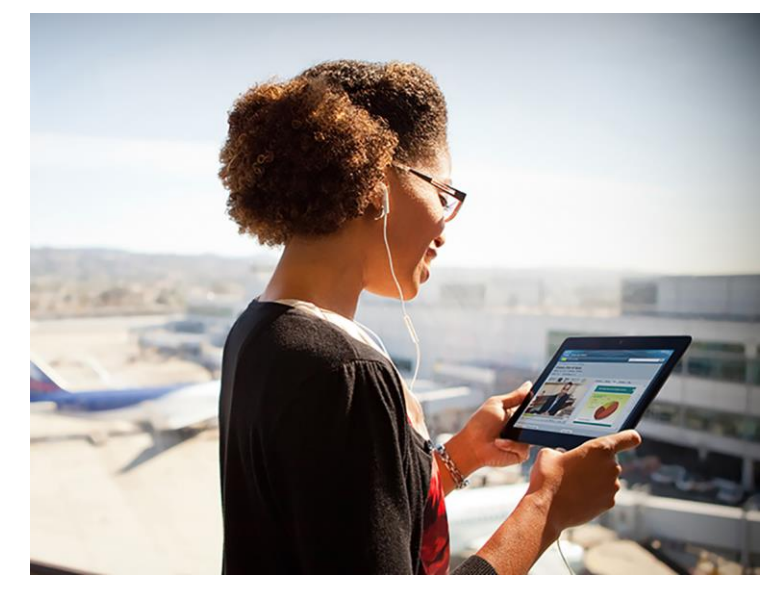
Cisco Spark has two meeting offers to suit different work styles.