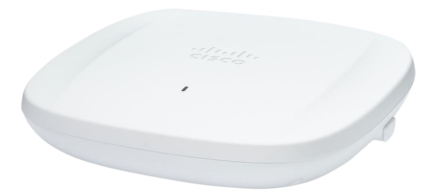
Figure 1. Catalyst 9136l access point

The Cisco® Catalyst® 9136 Series Access Points are the next generation of enterprise access points supporting the new 6-GHz band for Wi-Fi. They are resilient, secure, and intelligent.